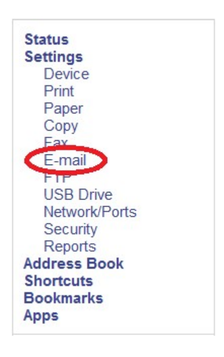
Step 3: Click on 'Email' in the menu.

Step 2: Open up a new tab in your web browser and enter this number into the address bar (do not enter it into search). The web interface for your MFD will come up. You normally will not need to log into the device. If you are prompted for a password, then your IT department has restricted access and will need to complete this process for you.